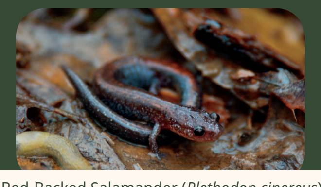
Red-Backed Salamander (Plethodon cinereus)