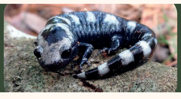
Marbled Salamander (Ambystoma opacum)