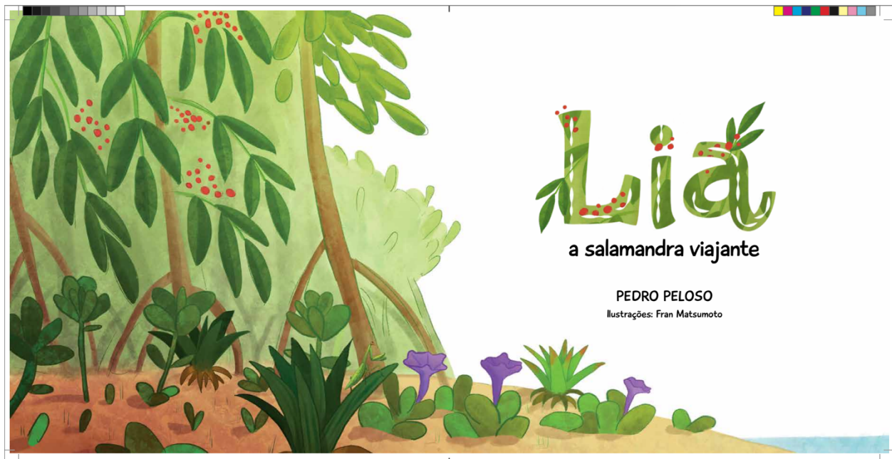
Front page of the book

Plot: The story features a Pará's Lungless Salamander named LIA (representing the species Bolitoglossa paraensis ) as the main character. One day our main character (Salamander) wakes up to see its habitat being destroyed (logged). She then starts crying and is heard by a migratory bird named DAVI (a purple Martin, Progne subis ) that then starts to talk to LIA. After introductions (where the main character explains what is a salamander), Davi realizes she is an amphibian and not a lizard (many people in Brazil think salamanders are lizards). Then, he tells LIA that he knows many other amphibians in Brazil that are also endangered due to habitat loss. They then set to an adventure where these two characters travel throughout Brazil and its distinct biomes meeting several amphibians (frogs) that are threatened with extinction.