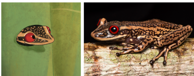
Belinha Perereca-de-capacete-pintada Nyctimantis pomba