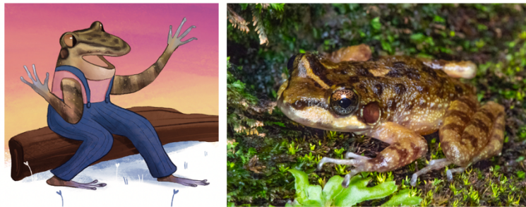
Xuxu Rã-das-Pedras-do-Sul Thoropa saxatilis