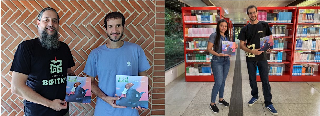
Donation of books.

The book was well received by the community in Brazil. Both scientist and non-scientists have reached out to compliment and to highlight how their kids enjoyed the story. Most importantly, many of the comments show that some of the central messages were conveyed.