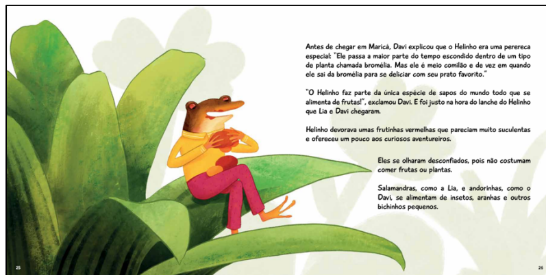
Example pages from the book with educational content.

Top: brief explanation of what are the main groups of amphibians. Bottom: one of the characters eating a fruit, text explains relevance of this biological fact, known only for a single species of frog from Brazil.