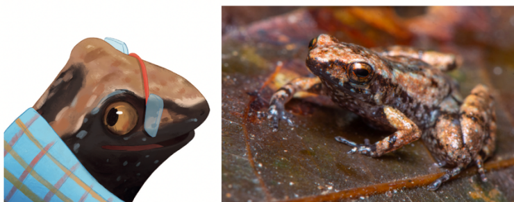
Rãzinza Rãzinha-da-Maranguape Adelophryne maranguapensis