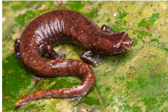
Lia Salamandra-do-Pará Bolitoglossa paraenses