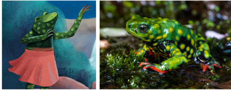
Sapa Mi Sapinho-Admirável-da-Barriga-Vermelha Melanophryniscus admirabilis